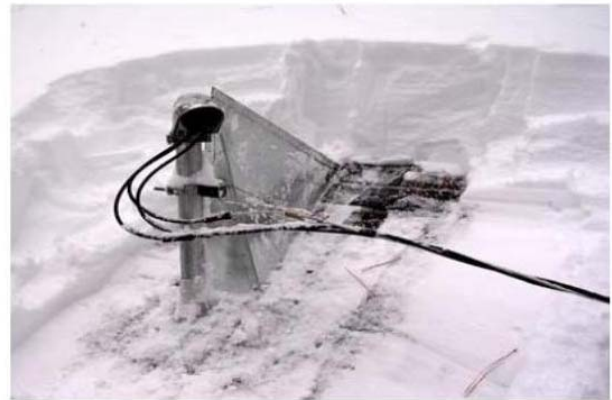
Snow Splitter constructed out of sheet metal are an alternative to Roof Crickets when only the mast needs to be protected.