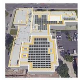
100kW Solar Array

Solar Array, Battery, Energy Efficiency, and Electric Vehicle Charging