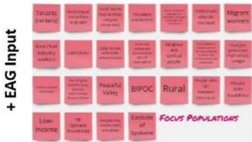
2026-2029 CEIP Advisory Group

Vulnerable Populations: Socioeconomic & Sensitive Populations at 8 or higher