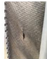
Tear in Fabric Duct Transition

If we could cut their energy consumption then we can support more of the load with the microgrid, the audit predicts that we could reduce their usage by 40% with all of the upgrades defined in the audit.